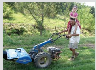
BCS tractor fitted with mower (above) and breaking sod with rotary plow (below).