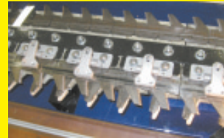
Rotary Sicklebar (Page 5)