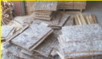
Bark Siding Provides Unusual Look (Page 26)