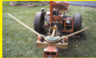
Log Splitter Pipe Bender (Page 29)