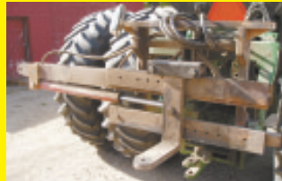
3-Pt. Drawbar Telescopes Sideways (Page 20)