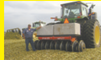
Roller "Massages" Silage (Page 19)