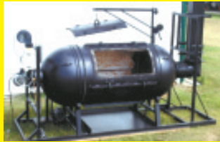
Rotating Incinerator Uses Less Fuel (Page 3)

To Subscribe, Call 1-800-834-9665 (Or Use Order Form On Page 44)