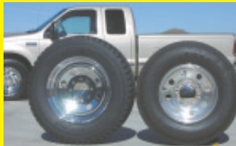
Wheel Upgrade For Pickups (Page 18)