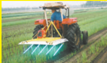
UV Light Kills Crop Disease (Page 16)