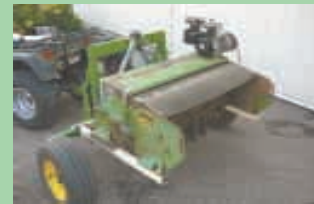
Stalk Chopper Pulled By ATV (Page 25)