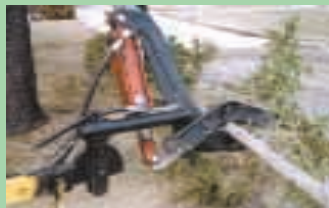
Tractor Shears Snip Tree Branches (Page 28)