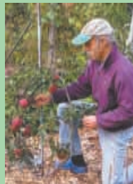
"Super Dwarf" Trees Bear Fruit Sooner (Page 17)