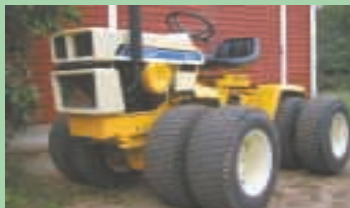
Dual Cub Cadet Looks Factory-Built (Page 18)