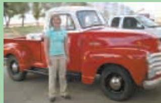
'52 Chevy Serves 3 Generations (Page 21)