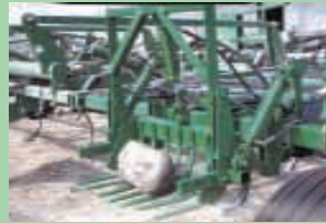
Cultivator Rock "Scoop" (Page 17)