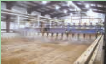
Manure Burner Pays For Itself (Page 43)