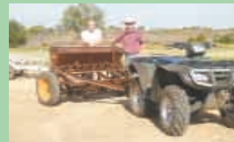
Home-Built Food Plot Drill (Page 20)