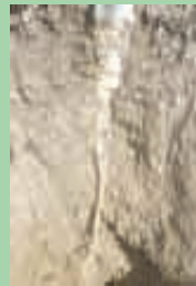
"Tillage Radish" Breaks Up Compaction (Page 3)