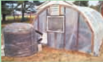
Greenhouse Heated By Compost (Page 2)

To Subscribe, Call 1-800-834-9665 (Or Use Order Form On Page 44)