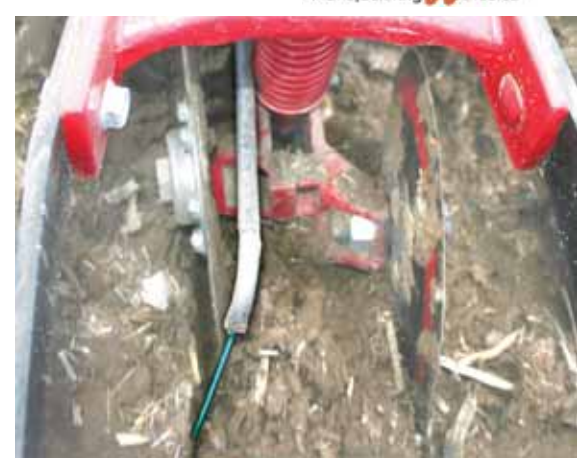
Case IH 2x2 Liquid Fertilizer Tube