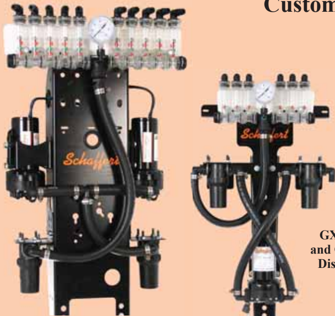
GX2 (double pump) and GX1 (single pump) Distribution Centers

Schaffert Mfg. configures complete fertilizer application systems for planters, drills, and other needs. These systems are customized to fit each individual's requirements. They are pre-built, so assembly is hassle free—just bolt on and go!