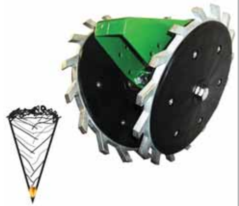
Mohawk Wheels stitch the seed V shut, creating a flat ice cream cone shape with the soil in and above the seed V