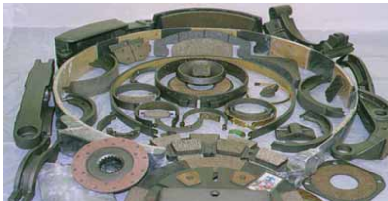
Photo shows examples of the type of relining jobs done by All Frictions Co.