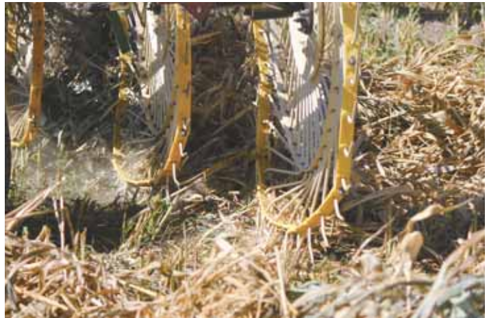
Hoop disperses pressure from ground contact over 8 or 9 different tines instead of just one. As a result, there's less vibration and less chance the tines will break.