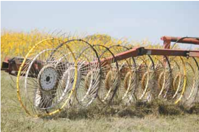
Molded poly straps bolt together to form a hoop that surrounds the rake wheel, providing support that stops the teeth from bending or breaking.