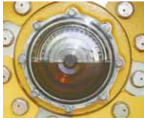
John Deere Idler

“Kile® Clear View® Caps” are designed for rubber track tractors. They let you see the level & clarity of the oil in idlers and rollers.