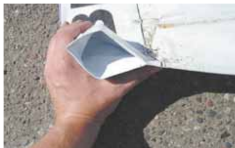
Tarps have channels on all four sides for pipe, cable or rope. Billboard vinyl is anti-mildew, anti-UV, and waterproof.