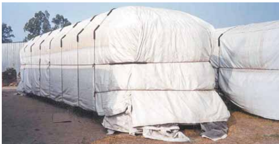
Industrial-strength billboard tarps can be used for everything from covering hay piles to protecting equipment and even lining farm ponds. Get more info at www.BillboardTarps.com .

Most of the billboard tarps have 3 in. wide sleeves or channels that run along all four sides so you can insert pipe, cable or rope to fasten them down. McConville also