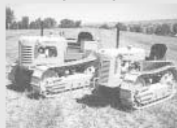
for Oliver-Cletrac crawler tractors, featuring new, used and rebuilt parts. We have most

"There are still thousands of these machines in use or owned by collectors."