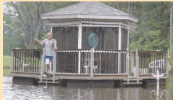
World's First Floating Gazebo (Page 27)