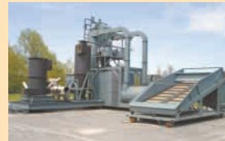
Turning Manure Into Oil (Page 20)