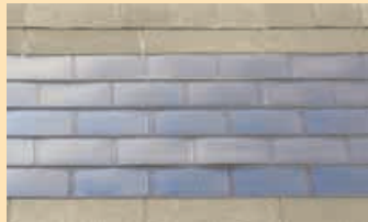
Solar Panels Look Like Shingles (Page 26)