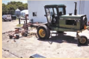
Swather-Rake Windrows Fast (Page 28)