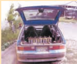
Car Converted To Electric Power (Page 2)