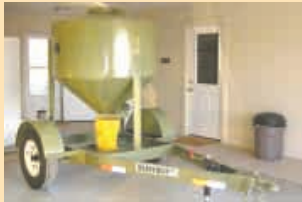
Corn Caddy Carries Corn For Stoves (Page 2)