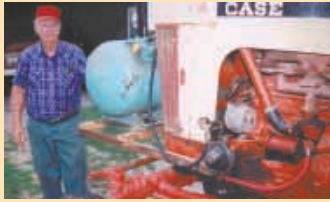
Tractor Converted To Run On Propane (Page 18)

To Subscribe, Call 1-800-834-9665 (Or Use Order Form On Page 44)