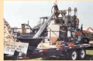
Do-It-Yourself 2-Press Biodiesel (Page 3)