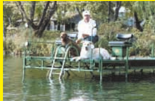
John Deere Boat Dock (Page 43)