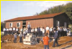
Friends Move Building By Hand (Page 2)