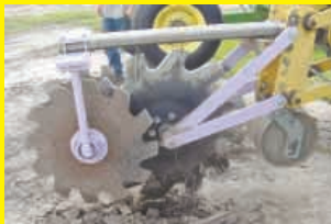
Giant Coulters Create "Seed Zones" (Page 17)