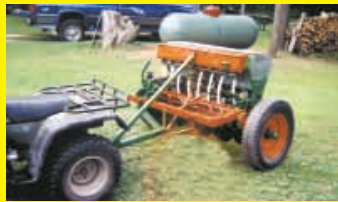
"Chopped" Drills Seed Wildlife Plots (Page 4)

To Subscribe, Call 1-800-834-9665 (Or Use Order Form On Page 44)