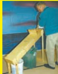
"Scrubber" Cleans Corn For Burning (Page 3)