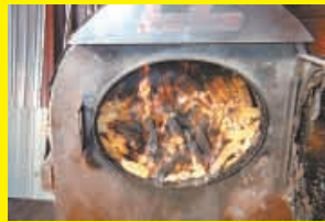
"I Burn Ear Corn In My Wood Furnace" (Page 4)