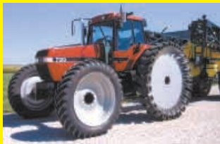
Farmer-Designed "Tall Wheels" (Page 2)