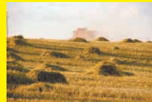
Combine "Pitchfork" Bunches Residue (Page 26)