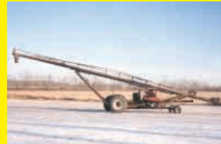
Cadillac Of SP Grain Augers (Page 28)