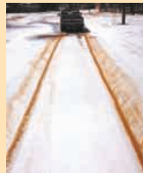
Sand Kit Boosts Pickup Traction (Page 2)