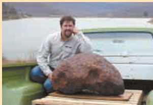
Record Meteorite Found On Farm (Page 20)