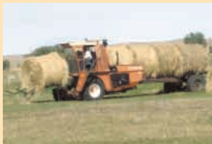
Self-Propelled Bale Retriever (Page 18)