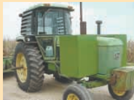
“Big Box” Deere Grill Guard (Page 3)