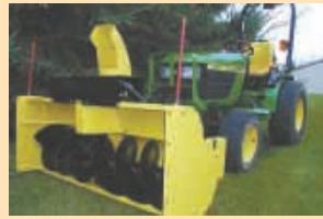
He Built His Own Snowblower (Page 19)