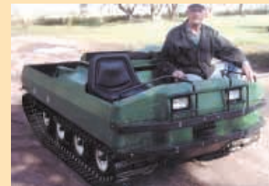
Home-Built Tracked Vehicle (Page 39)