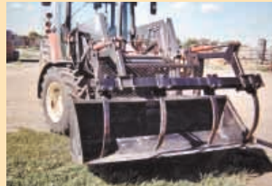
How To Make A Great Grapple Fork (Page 26)