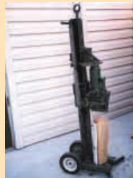
“Hand-Cranked” Wood Splitter (Page 25)