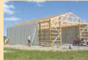
Do-It-Yourself Pole Barn (Page 17)