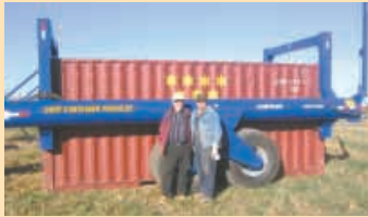
Invention Brings Containers To Farm (Page 28)

To Subscribe, Call 1-800-834-9665 (Or Use Order Form On Page 44)