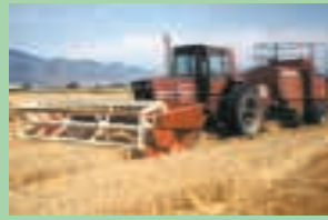
Tractor Header Speeds Straw Baling (Page 25)