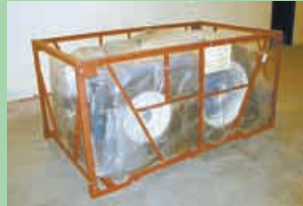
Crated Tractors Sell Like Hotcakes (Page 28)