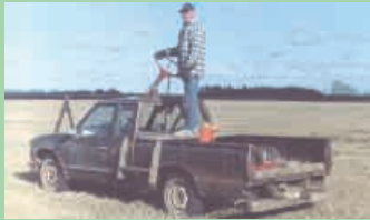
Gopher-Trapping Truck (Page 26)

To Subscribe, Call 1-800-834-9665 (Or Use Order Form On Page 44)