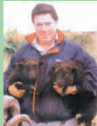
World’s Smallest Sheep (Page 25)