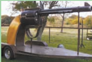
6-Shooter Barbeque (Page 3)