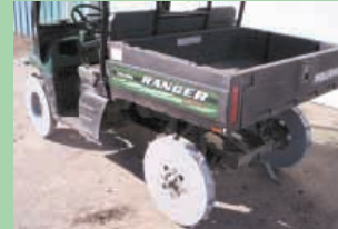
Steel Wheels For “Truck-Type” ATV’s (Page 2)