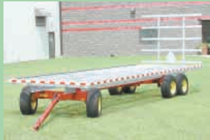
All-Steel “Lifetime” Wagon Bed (Page 18)