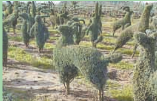
They “Sculpt” Plants Into Animals (Page 19)