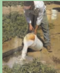
Milk Sweetens Fruit, Vegetable Crops (Page 27)