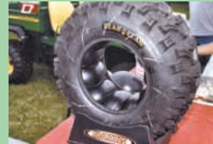
Flat-Proof Tire Balls (Page 19)