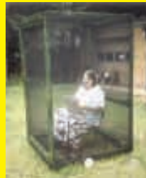
Rolling Screen Porch Helps Catch Breeze (Page 2)

FREE "Made It Myself" Tractor Book (See page 44)