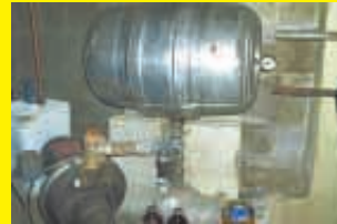
"Beer Keg" Well Tank (Page 16)