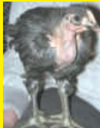
Naked Neck Chickens (Page 19)