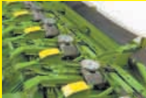
Deere's New Header-Mounted Chopper (Page 19)