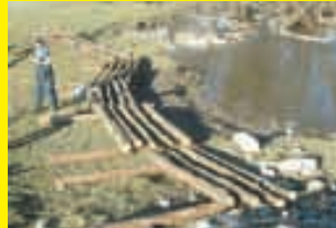
Barrier Keeps Cows Out Of Creek (Page 2)