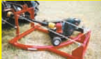
Fence Mower Rolls From Side To Side (Page 3)

To Subscribe, Call 1-800-834-9665 (Or Use Order Form On Page 44)