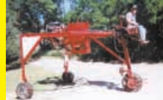
High-Clearance "Field Checker" (Page 4)