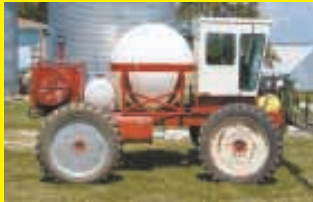
Round Tank Sprayer (Page 17)