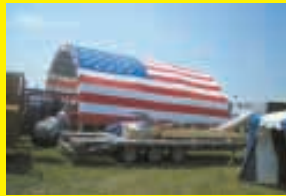
Patriotic Hoop Building (Page 17)