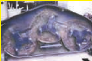
"Made It Myself" Mower Blades (Page 4)