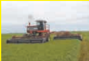
Articulated Double Windrower (Page 4)