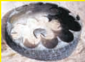
Rubber Horseshoes Cut Out Of Tires (Page 17)