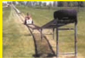
570-Ft. Farmyard Roller Coaster (Page 2)