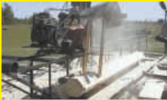
2-Blade Sawmill Makes 8-Sided Logs (Page 25)

To Subscribe, Call 1-800-834-9665 (Or Use Order Form On Page 44)