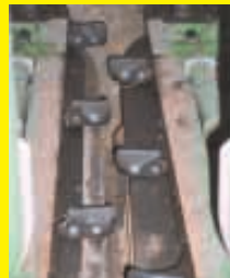
Chain Extenders Pull In Stalks (Page 19)