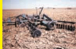
“Reverse Gang” Field Disk (Page 20)