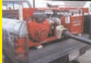
Portable Pto Power For Pickups (Page 18)