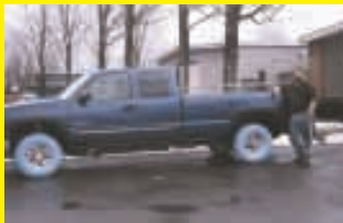
Colored Tires For Pickups (Page 4)