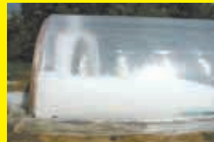
Soap Bubbles Insulate Greenhouse (Page 3)