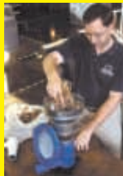
Do-It-Yourself Forage Sampler (Page 19)