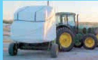
Tarps Made Out Of Airbag Fabric (Page 19)

To Subscribe, Call 1-800-834-9665 (Or Use Order Form On Page 44)