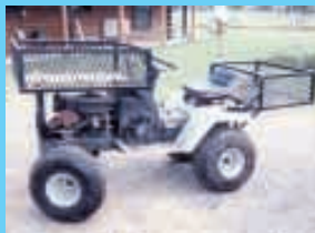
Do-It-Yourself 4-Wheeler (Page 43)