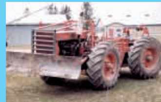
Made-It-Myself Articulated Tractor (Page 18)