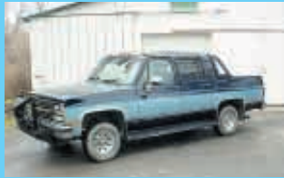
Chopped Suburban Makes Great Pickup (Page 4)