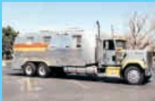
Semi Fitted With Airstream Sleeper (Page 2)

To Subscribe, Call 1-800-834-9665 (Or Use Order Form On Page 44)