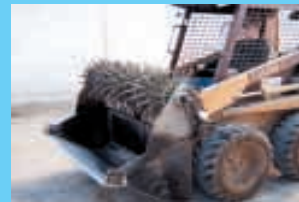
Rotary Hoe Silage "Defacer" (Page 3)