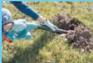
Blower-Powered Gopher Gasser (Page 43)