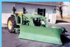
Loader-Mounted V-Blade (Page 20)