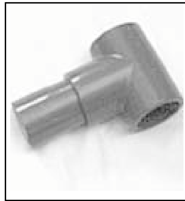
Short T-shaped sleeve fits over drill chuck, allowing you to hook up a shop vac hose.

Contact: FARM SHOW Followup, Stan McDonald, 402 Rosedale Ave., Foxboro, Ontario, Canada K0K 2B0 (ph 613 968-9516; E-mail: smcdonal@kos.net).