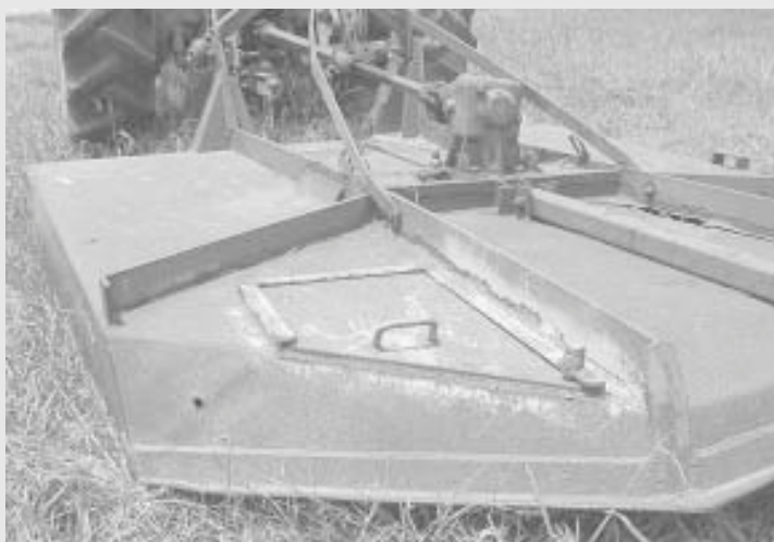
Liles cut an 8 by 10-in. hole on back part of deck. Sliding door allows access to blades.