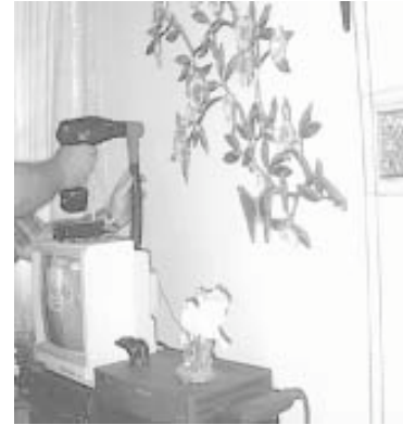
Unit keeps drill dust from falling onto furniture and carpet.