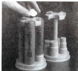
Coin stacker is sized to take only the exact number of coins needed.

For more information, contact: FARM SHOW Followup, Zay Products, 7743 Big