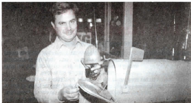
Transmitter on mailbox sends signal to receiver inside home when mail's delivered.