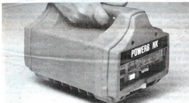
Powerbank carries enough power to run a hand drill for 8 hrs. without recharging.

For an information "sampler" explaining all types of replacement bulbs available and how they work, as well as for a catalogue of available products, send $3.00 to: FARM SHOW Followup, Rising Sun Enterprises, P.O. Box 586, Snowmass, Colo. 81654 (ph 303 927-8051).