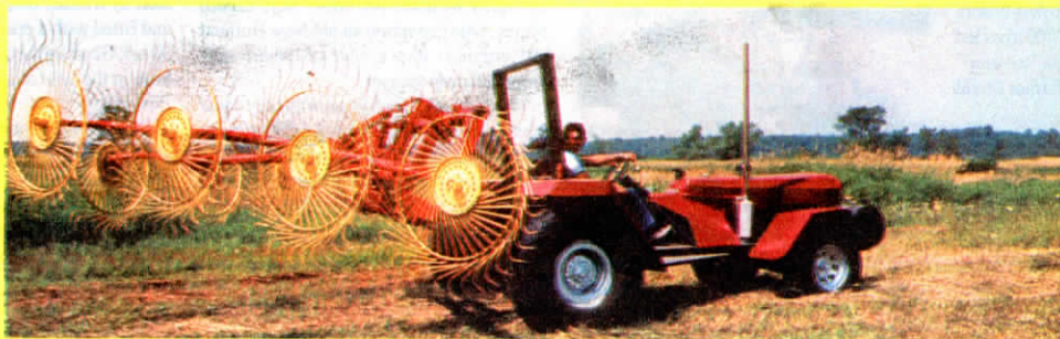
High-Speed Raking Tractor - "I can rake up to 20 acres per hour traveling at 15 mph," says the farmer who built this low-to-the-ground raking tractor out of a combination of old car and tractor parts.