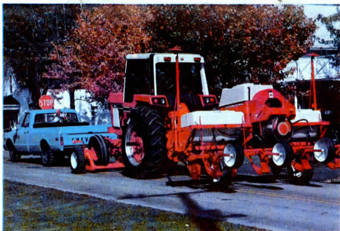
Towmobile behind pickup transports tractor with one or two implements attached.