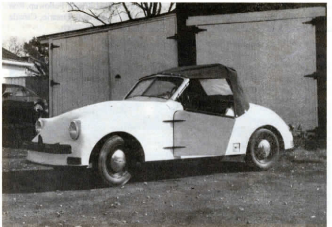
Car is powered by three 12-volt batteries controlled by a solid-state controller.

Contact: FARM SHOW Followup, Tony Woodroffe, Ardmore PDC, Pvt Bag 14, Papakura, Auckland, New Zealand (ph 09 2980228).