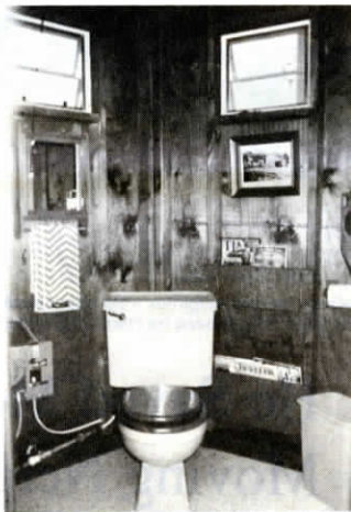
Outhouse is complete with flush toilet, magazine rack, and vinyl floor.

The outhouse sits on the site of a 100-year old smokehouse. Some of its bricks are