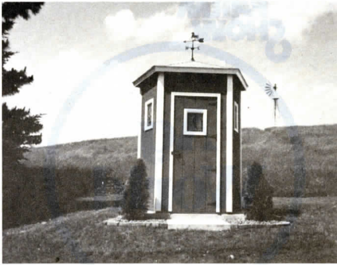
Water for the 5-sided "luxury outhouse" is supplied by a windmill (in background).