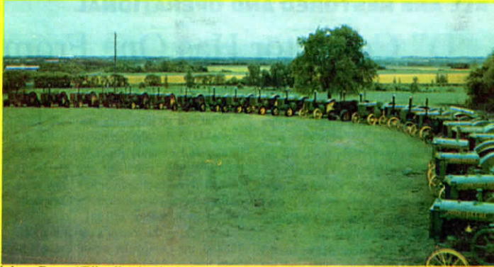
Unique Deere "D" collection includes at least one Model D for every year they were built.