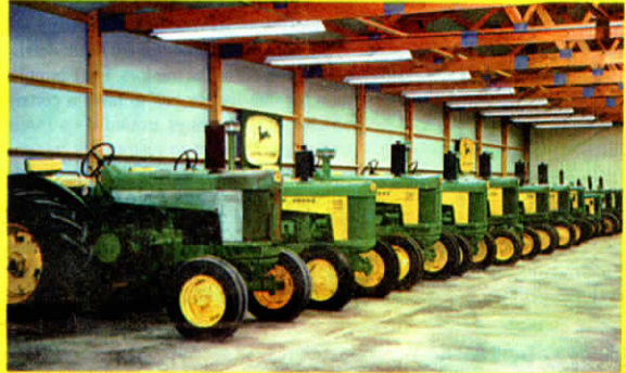
Kansas farmer Mel Kopf reconditioned 53 Deere 2-cyl. tractors, including nearly one of every model built between 1935 and 1960.