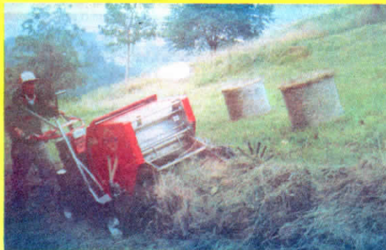
Mini Round Baler - New walk-behind mini round baler makes 22-in. dia. round bales wrapped in netting. Great for baling steep slopes and for smaller operators who can't justify a full-size baler. (See page 22)