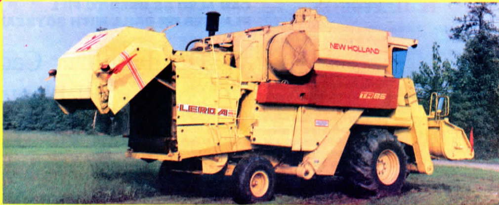
Combine-Mounted Round Baler - Baler mounted on back of New Holland combine lets this Italian farmer make big round bales of straw on-the-go as he combines. Combines have plenty of hydraulics to operate balers, he says. (See page 21)