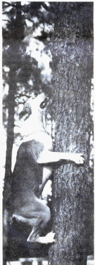
Flatnose is a whiz at climbing up trees, but he can't climb down on his own--he either jumps or falls.

Since Flatnose has become a celebrity, everyone wants to see him, but he just goes on eating and living a good dog's life, unaware that he's received a letter from President Reagan, from the producers of "Hee Haw" and from hundreds of viewers who've seen him perform on TV.