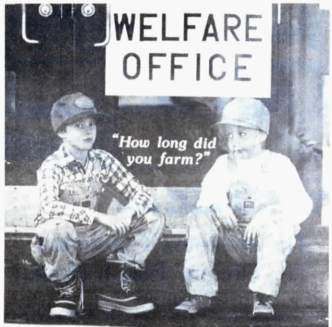
Original poster had the boys wearing hats with Federal Land Bank and PCA insignias.

For more information, contact: FARM SHOW Followup, Country Kids, Suite 1247, P.O. Box 572, Milwaukee, Wis. 53201.