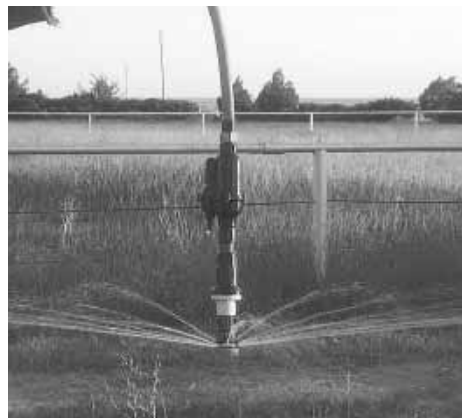
Filter fits between the hose and the regulator on center pivot drop nozzles (left). To flush out sediment you just push up a small release valve on side of filter.

"Just push up the small release valve on the side of the filter," says Beer. "The water pressure will quickly flush out the sediment."