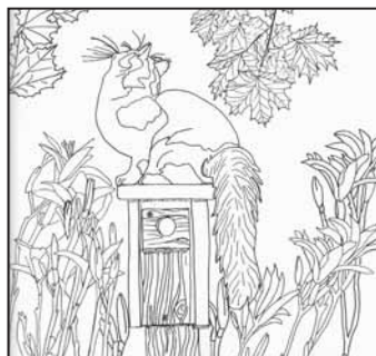
The 50 drawings are printed on heavy paper so they can be cut out of the book and framed.

artists are going through photos for ideas and deciding on a theme for Volume Two.