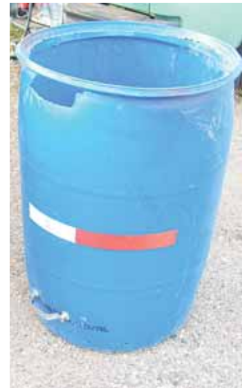
Gary Swensen converts old plastic 55-gal. barrels into garbage cans that are lightweight and won't rust.

Contact: FARM SHOW Followup, Gary Swensen, 1408 Sunrise Drive, Yankton, S. Dak. 57078 (ph 605 660-3489; g_swensen@msn.com).