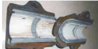
One pipe (white) was 2 in. in dia. and the other (grey) was 3 1/2 in. He cut the 2-in. pipe lengthwise, then cut the halves into 4-in. long sections that fit together in pairs around the axle.