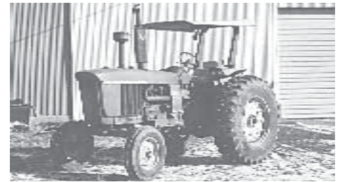
Permanent replacement seals don’t leak like factory seals, says Boling Machine.

We also sell load control shafts for most models, 2950, 2940, 2840, 2850, 2855, 2550 and many others. All seals are guaranteed.