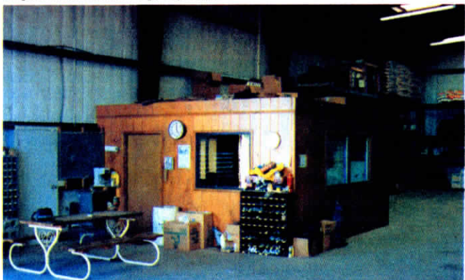
Shop has an office, bathroom and lunch area. Skylights keep the interior bright.

For more information, contact: FARM SHOW Followup, Dale Kitchens, Rt. 1, Box 211, Slaton, Texas 79364 (ph 806 828-5843).