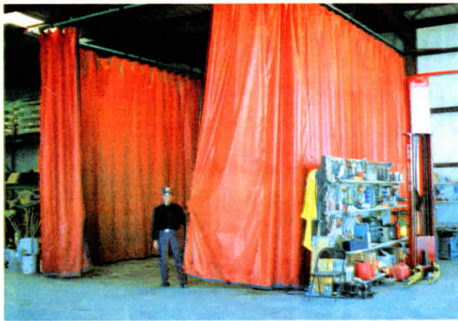
Wash bay consists of a 20-ft. high curtain set up around one of shed's "bays". A 6-ft. deep catch pit collects dirt that's washed off vehicles and equipment.