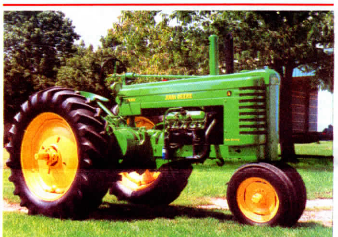
Jones fitted his old Deere with a turbocharged 1981 Oldsmobile 350 diesel engine.