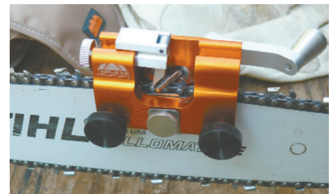
Timberline’s crank-type chainsaw sharpener comes with a carbide cutter that rides the bar. The operator pulls the chain through to sharpen each tooth.

The Timberline Sharpener comes with your choice of carbide cutter for $124.95. Additional carbides are available for $20 in sizes 1/8”, 5/32”, 3/16”, 13/64”, and 7/32”. If you don’t know your chainsaw size their website gives some guidance or give them