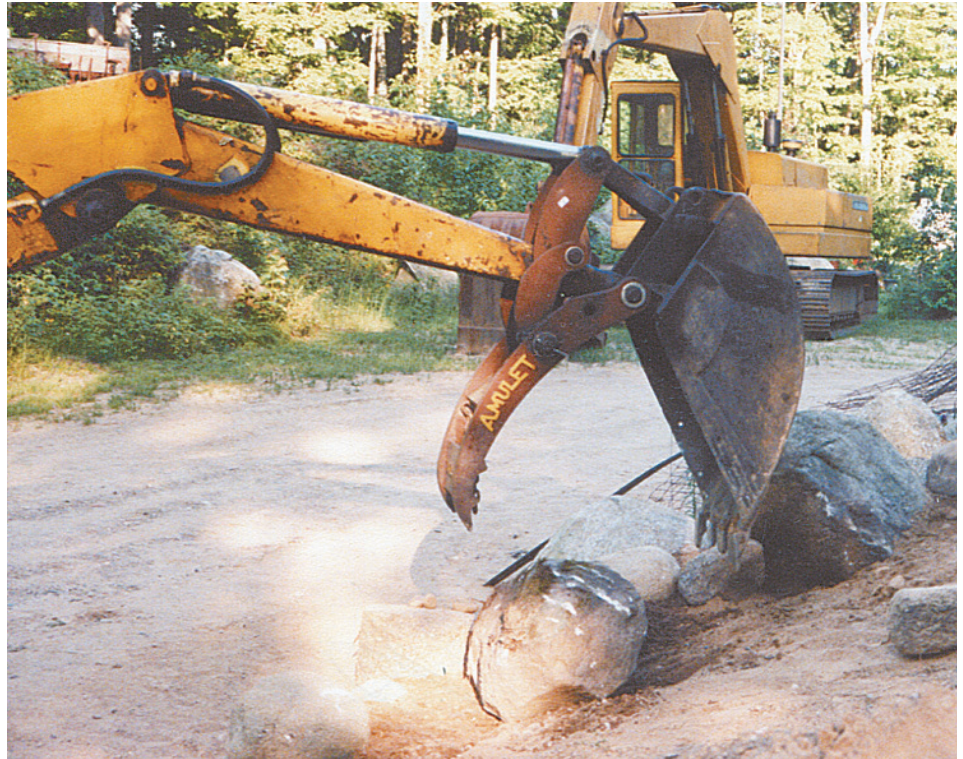
HoeClamp moves as bucket moves. Lund says it’s easier to use than a “hydraulic thumb”.