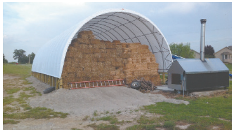
Adlai Schetter and his dad burn small square bales of various biomass crops, including Miscanthus grass and tropical maize, to heat their workshop.

Miscanthus and tropical maize are baled after they have dried down. In the case of