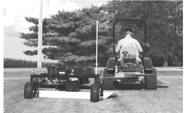
www.KunzEng.com ph 815 539-6954

behind ATVs and utility vehicles. The heavy duty, high capacity 40" and 60" models come with electric start engines ranging from 10.5-23 hp. Both commercial and noncommercial grade engines are available. The AcrEase Finish Cut mowers are extremely maneuverable, easy to pull and stable on steep banks. They are also capable of mowing at today’s standards in high speed mowing.