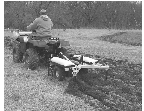
Reader Inquiry No.102

Contact: FARM SHOW Followup, Kunz Engineering, Inc., 2100 Welland Rd., Mendota, Ill. 61342 (ph 815 539-6954; info@kunzeng.com; www.KunzEng.com).