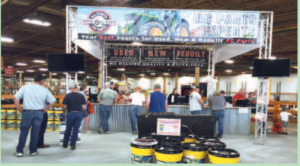
All States Ag Parts opened a huge new parts distribution center this past spring in Lake Mills, Iowa. More than 10,000 parts are available at the center for pickup or overnight shipping.

Deere, Case-IH, Agco, Bobcat and more. The company is somewhat unique with its ability to supply a broad line of parts including used, new and rebuilt parts.