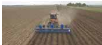
Plowing in the drip lines.

"A couple of years ago I replaced my old torch with an oxy-acetylene torch that I bought at Harbor Freight . I was planning to use the new torch one day when I heard a hissing noise, luckily before I hit the striker. It turned out the hose had dry-rotted. I called the company for help but they weren't interested in my problem. So I put the 40-year-old hose from my old torch on it, and now it's working fine."