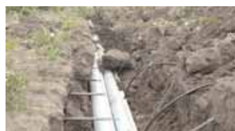
Main water pipes feeding drip lines.

"I was interested in adding irrigation, but a center pivot wouldn't work. We have a rolling topography with creeks and ditches and no flat fields for center pivots. I heard about subsurface drip. When I checked it