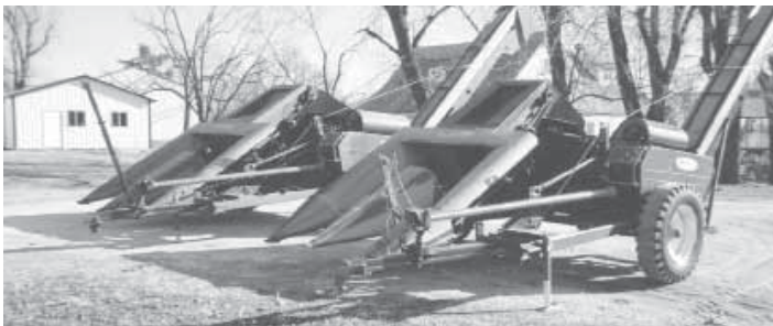
Reuben Zimmerman buys used New Idea corn pickers from farmers and rebuilds them, converting wide row models to narrow row.