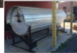
Double six ton presses with new roaster converts the trypsin enzyme for hogs and poultry.

Contact; Waldermfg.com, 1525 South County Road I, Wittenberg, WI 54499 Mark’s Cell 715-581-1525 Ed’s Cell 715 581-5439 E-Mail: waldermfg@hotmail.com