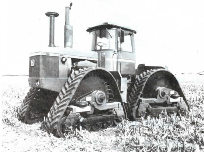
Kelderman showed new rubber track system at farm shows this fall mounted on a Deere 8640 4-WD tractor. The same tracks can also be used on a combine.

Contact: FARM SHOW Followup, Gilbert & Riplo Co., 4865 South Ravenna Road, Ravenna, Mich. 49451 (ph 616 853-2284).