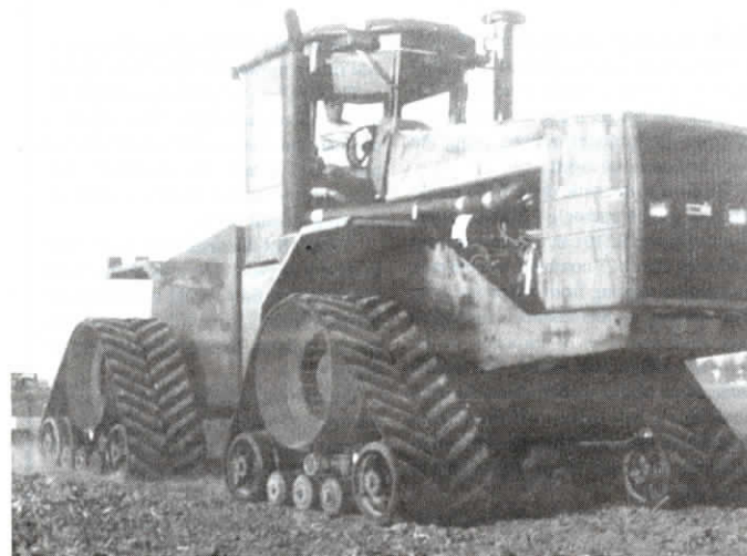
Drive sprocket on Gilbert & Riplo's 4-WD track assembly bolts onto planetary drive or wheel hub, and undercarriage fastens to tractor with bracket.

Contact: FARM SHOW Followup, Kelderman Mfg. Inc., 2686 Hwy. 92, Okaloosa, Iowa 52577 (ph 515 673-0468).