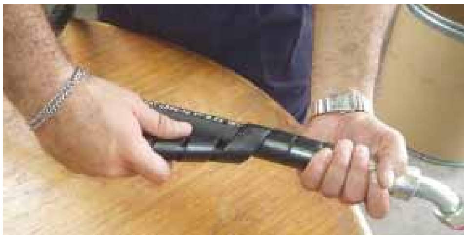
HoseSaver wraps provide protection for hydraulic hose as well as wires and cables. Raguse also sells a canvas wrap, below left. He built the machine that cuts plastic pipe of different sizes.

The spiral wrap allows for wire, cable and hose breakouts in any orientation, making it ideal for use on long continuous runs where many leads, or breakouts, are required. Spiral wrap hose protectors are available in lengths of 100 ft. with custom-cut shorter lengths available upon request. Raguse also offers Canvas Hose Protectors for hard-to-reach areas, and large bundles of hoses. These canvas HoseSavers are custom-made for any size hose or bundles of hoses and are secured with Military-grade velcro.