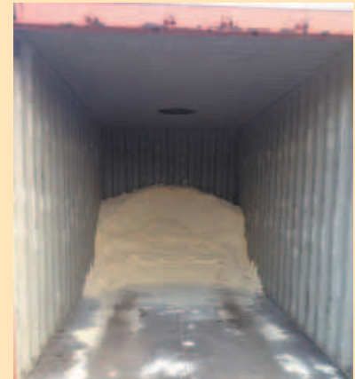
Mack Rankin needed extra feed storage for his 60-cow herd so he bought a 20-ft. long shipping container and modified it to use with his skid loader-based feeding system.