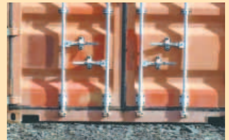
He cut a hole in container roof for access and then cut a 35-gal. drum in half and set it over hole, adding a hinged lid (left). Container’s shale pad prevented locking rods on door from engaging so he shortened the rods slightly.

from the inside and closed from the ground outside.