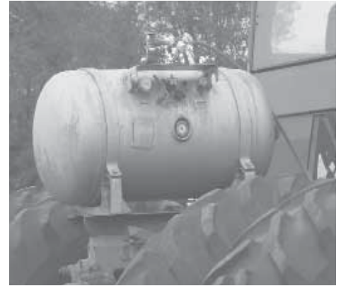
Propane Enhancer injects a little propane into diesel engines for faster speeds, more power, and a cleaner burn in tractors and trucks.

He says the propane simply helps burn diesel fuel more efficiently. Typically, he explains, only 75 percent of diesel used is burned. With the propane injected, efficiency jumps to 98 percent. “That’s where we get our increased power,” says Ridgway. “We turn that wasted fuel into energy. Burning the diesel more completely reduces carbon buildup in an engine for longer engine life. It also cleans up the exhaust.”