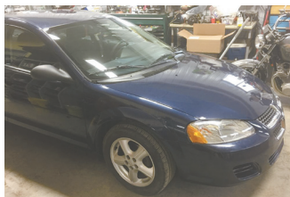
Using painted parts he bought online, Roger Gutschmidt repaired his 2006 Dodge Stratus for $1,000 worth of parts - versus the body shop estimate of $3,453.

Unlike loggers, birch branch thieves can haul a valuable load away in a pickup or trailer. Officials say wholesale buyers are posting birch-wanted ads on Craigslist, paying between $1 and $3 per branch. Menards sells birch "poles" online for $6.99 and on Amazon you can buy four 48-in. poles for $45.99.