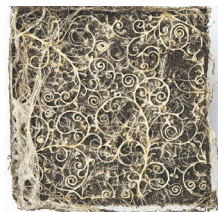
Underground forms made by the artist allow roots to grow into beautiful patterns as they search for nutrients.