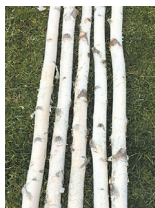
A hot market for birch branches has triggered an increase in illegal birch tree harvesting.

Law enforcement officials in the Midwest say there's been a rash of illegal cutting of small birch trees that are being smuggled out and sold as decorations in stores and online.