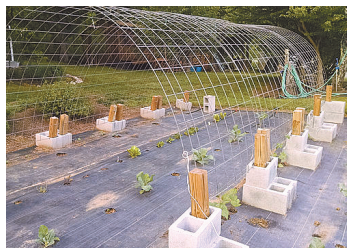
To make a garden trellis, Chuck Angier staples the ends of cattle panels to chunks of 4 by 4's and sticks them into cement blocks.