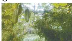
Mature cukes dangle from trellis, making them easy to pick.