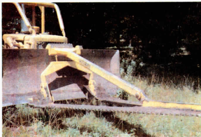
Twin cutterbars making up the V-shaped saw are almost 13 ft. long. Mounted on a D-7, it'll clear an acre an hour and will saw trees up to 7 ft. or more in dia.