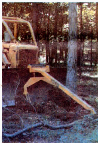
Giant saw will cut through a 24 in. dia. tree in about 4 min., leaving cleared ground completely flat with no holes to level or fill, or stirred up rocks to bury.

There are from 88 to 104 teeth on the three available blade saws. Each tooth, about 1 in. thick and hard surfaced, is removed by driving out a roll pin, and you can replace all of them in about an hour. Dove says the self-sharpening teeth, which cost about $5 each, have to be replaced or resurfaced once a year in normal soil, and about every 40 acres if run heavily through rock.