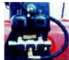
Two accumulator units, connected together and designed to withstand high pressure, mount on loader.

Contact: FARM SHOW Followup, Trima Ltd., 33 Tatton Court, Kingsland