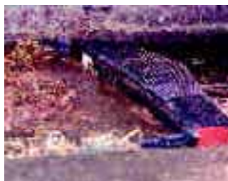
Scraper is driven by two motorized wheels powered by an electric motor.

Contact: FARM SHOW Followup, Miro, 12 route de Laviron, 25510