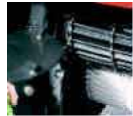
Mower uses a stiff-bristled nylon brush running against a metal roller to condition hay, then spreads the crop over entire mowing width.

Tests show that the HPC can reduce grass drying rates by half compared to conventional mower-conditioners, and that the crop dries faster than it would after a sepa-