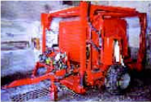
Bale chamber is divided into two sections. In "baling" position, the upper section is fixed to bottom section of rollers to create a normal circular bale-forming chamber.

Editor Mark Newhall recently attended the SIMA farm show in France, where some 300,000 people flocked to view nearly 2,000 exhibits. The show is held every other year, usually in early March. Featured here are some of the new products and ideas shown at this year's show. Most of the companies featured are looking for North American distributors or manufacturers.