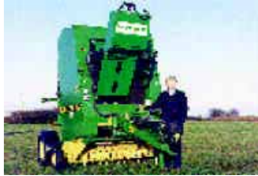
Binder-Wrap unit attaches to front of baler and wraps three 20-in. wide strips of cling-type plastic on each side of bale.