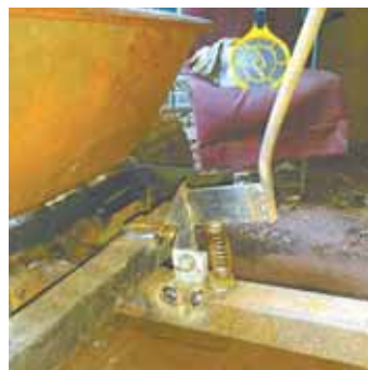
Spring-loaded trip lever is used to dump bucket.

Henson uses an early 1980's Allis Chalmers Simplicity garden tractor to pull the dump