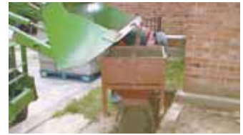
Cement is dumped into a second hopper which loader then moves to trench. There, a trap door on the hopper is manually opened to release concrete.