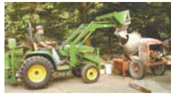
Sand and gravel hopper sets on metal stand. Loader lifts hopper to pour material into cement mixer. As loader bucket tips, it activates a lever that trips trap door to dump load.