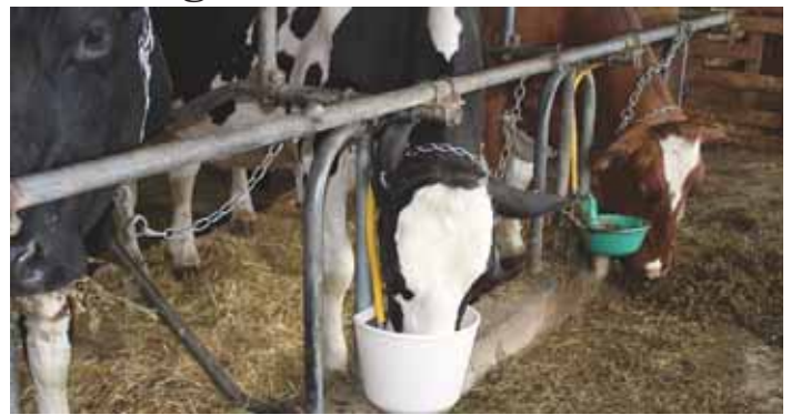
Kendu Zero Spill water bowl is deeper than regular bowls and has a high-flow tube valve located low inside it. Cows can't raise water level above 2 in. unless they bury their noses in water and hold the valve down.

He adds that the high rim of the bucket reduces the chance of a cow lifting feed into the bucket, and the high flow valve scours