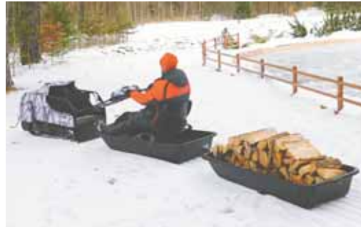
SnowDog power unit pulls rider on a sled. It goes up to 20 mph and can tow up to 1,100 lbs.

Contact: FARM SHOW Followup, Charlie Trayer, 253 CR 211, Seymour, Texas 76380 (ph 940 453-6708; www.charliescowdogs.com; trayer@windstream.net).