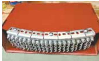
Photo shows how redesigned chain guard can be mounted on a curved chute. Bottom photo shows straight model on a Kubota riding mower.

Contact: FARM SHOW Followup, Meadowlarc Welding, 23501 13 Rd., Montezuma, Kan. 67867 (ph 620 846-2171; meadowlarcwelding@gmail.com; www.meadowlarcwelding.com).