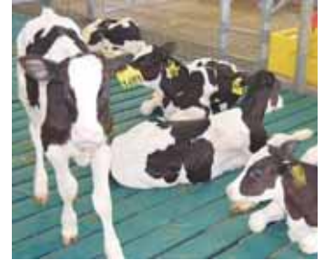
Mats provide cattle with a softer surface with more "give" to walk on.

Slat Mats are available in 3 different mat designs, depending on the weight of the