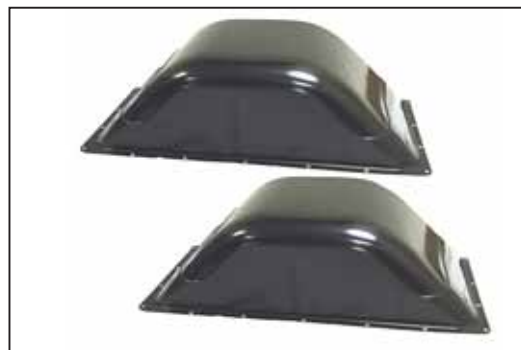
Aftermarket wide wheel tubs allow you to fit bigger wheels and tires to your pickup.

Contact: FARM SHOW Followup, NextGen Group, LLC, 623 RD. M47, Harlan, Iowa 51537 (ph 844 752-8628; sales@next-gen-group.com; www.next-gen-group.com).