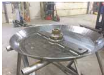
Mower's heavy duty "stump jumper" protects blades from obstacles.

"The new design allows you to make use of twisted chains, which work better than straight chains because the twisted design makes a better barrier," says Robbins. "I use lock nuts on the bolts to secure the chains so they can't work loose and fall off. I spray