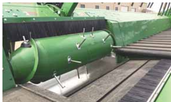
Lankota’s new bean saver brush kit is designed for Deere Flex heads equipped with auger platforms (above). They also offer a bean saver kit for Deere Flex Draper heads.