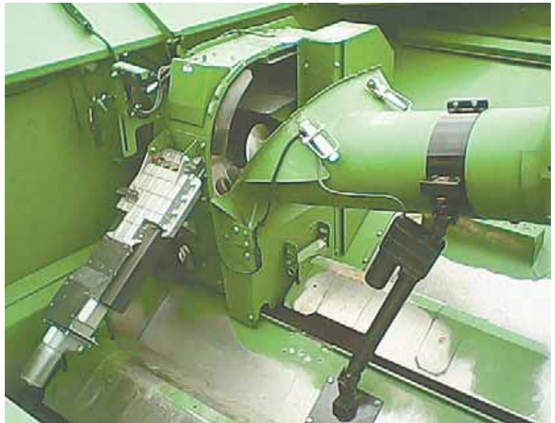
Power folding kit lets operator use a handheld remote from inside the cab to lower combine’s grain tank fountain auger down into tank.

Contact: FARM SHOW Followup, PWR EZ Systems, 9006 Rogers Road, Castalia, Ohio 44824 (ph 419 357-7458; www.pwrezsystems.com).