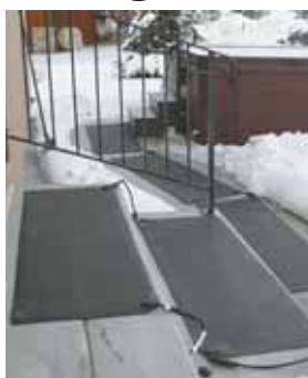
Electric snow melting mats can be connected to each other to extend their reach.

Contact: FARM SHOW Followup, HeatTrak, 3641 Clearview Parkway, Doraville, Georgia 30340 (ph 888 586-4904; sales@heattrak.com; www.heattrak.com).