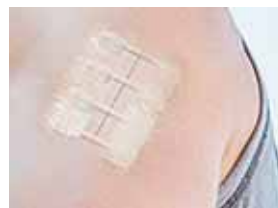
Center ZipStitch on wound and press it firmly onto skin, then pull tab to remove paper frame and pull each zip tie to close wound.