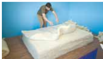
A wool mattress being made.