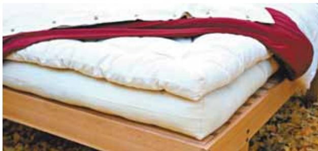
Wool mattress, topper and comforter are designed to help you sleep better.

Pour oil to depth of 2 in. into a Dutch oven; heat over medium heat to 350°. Drop batter by rounded tablespoons into hot oil; fry in batches, 30 sec. to 1 min. on each side. Drain on a wire rack. Sprinkle with powdered sugar.