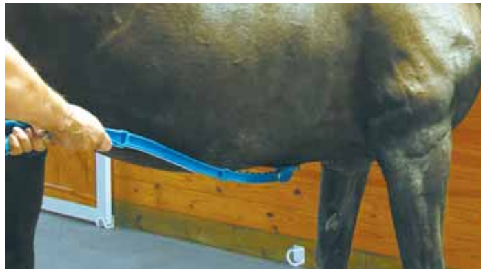
Made from fiberglass-impregnated plastic, Scratch Me Silly tool is designed so you don't have to bend over when scratching the animal.

Contact: FARM SHOW Followup, Scratch 'N All, P.O. Box 92, Dillsburg, Penn. 17019 (ph 888 972-7282; scratchnall@gmail.com; www.scratchnall.com).