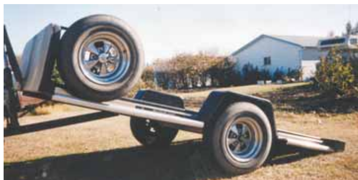
Hydraulic jack bolts onto trailer's hinged tongue. Nielsen unlatches a metal tab to release front end of trailer from tongue, then pumps jack up until trailer's back end touches the ground.

Contact: FARM SHOW Followup, Harvey Nielsen, P.O. Box 1032, Melfort, Sask., Canada S0E 1A0 (ph 306 752-9253).