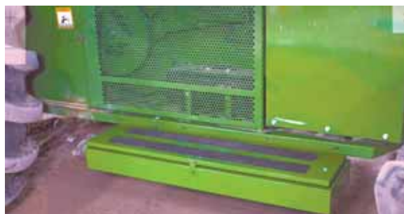
Step-on toolbox has a pair of built-in support arms that bolt on in place of combine's original step.

Contact: FARM SHOW Followup, Sloan Express, 120 N. Business 51, Assumption, Ill. 62510 (ph 800 934-9777; nbrazel@sloans.com; www.sloanex.com).