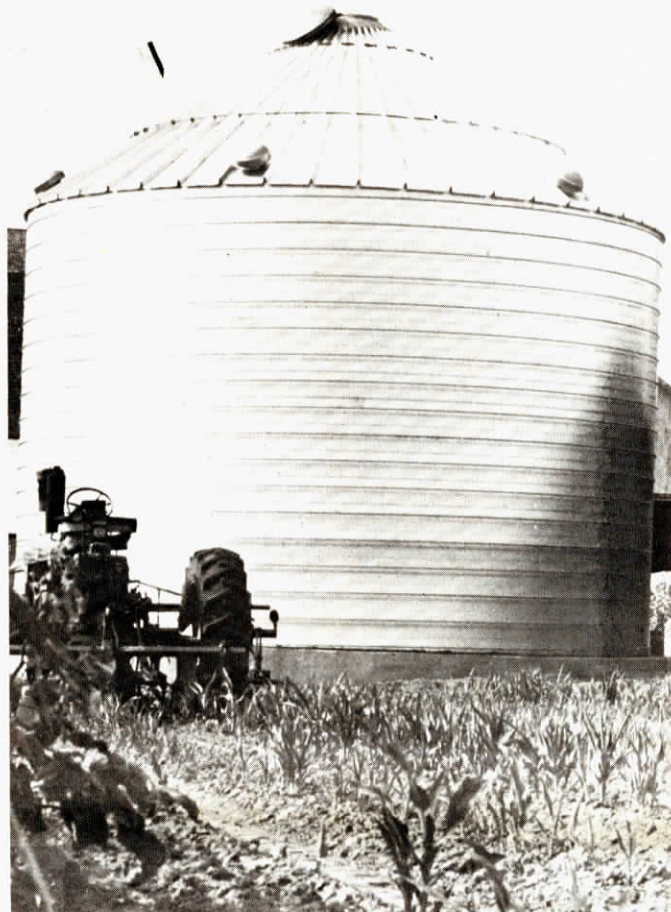
Upper left photo shows how structure spirals upward as it is formed from coils of steel. Structure spirals up 15 in. per revolution.

For more details, contact: FARM SHOW Followup, Lipp Systems Midwest, 1000 Spruce Street, Terre Haute, Ind. 47807 (ph 812-238-2966).